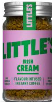
Flavoured Instant Coffee Irish Cream 6 x 50g 50-34718-08109-4