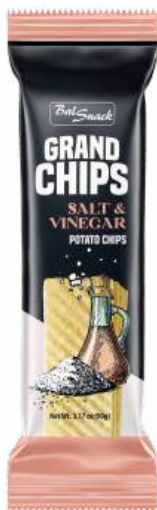
Salt and Vinegar 16 x 3.17oz 47-40053-00891-7