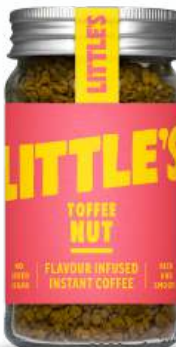
Flavoured Instant Coffee Toffee Nut 6 x 50g 50-34718-08119-3