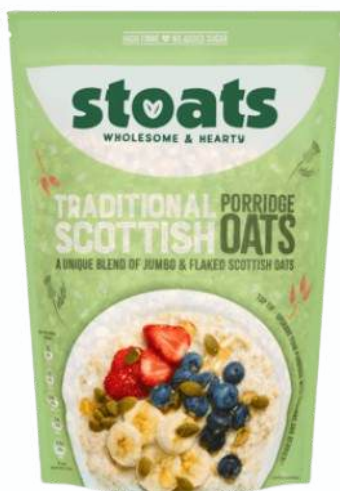
Traditional Scottish Porridge Oats 6 x 750g 50-60183-67153-9