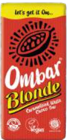
Blonde Caramelised White Chocolate 10 x 70g 50-60102-66276-1