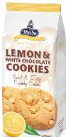
Merba, 12 x 7.05oz White Chocolate Lemon Cookies 87-10502-71827-4