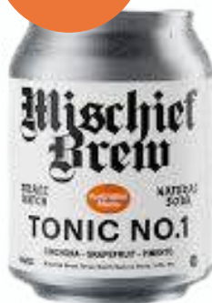
Tonic No.1 (4-Pack) 6 x (4 x 8.45 fl oz) 93-59084-00020-0