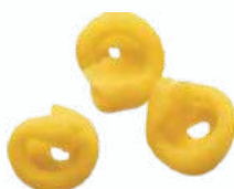
Schneckli 12 x 500g 4008643163256