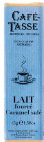
Milk With Smooth Caramel Filling 38% 30 x 45gr 54-00219-50620-4