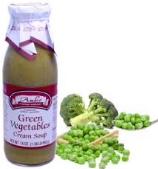
Green Vegetables Cream Soup 12 x 500ml 8-12667-00033-6