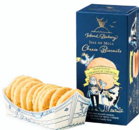
Isle of Mull Cheese Biscuit Farmhouse Cheddar 12 x 3.5oz 5060027071303