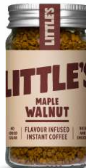
Flavoured Instant Coffee Maple Walnut 6 x 50g 50-34718-08108-7