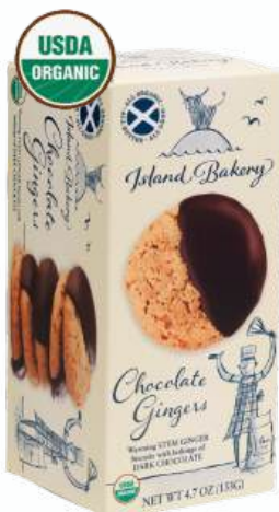
Organic Chocolate Ginger 12 x 4.7oz 5060027070191