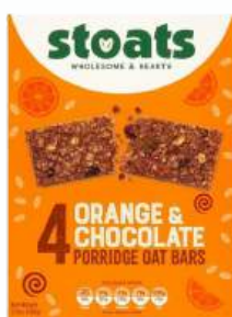
Orange & Chocolate Porridge Oat Bar 10 x 168g 50-60183-67395-3