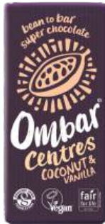
Centres Coconut & Vanilla 10 x 70g 50-60102-66217-4