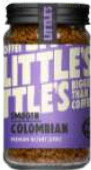
Premium Origin Instant Coffee Colombian 6 x 50g 50-34718-07004-3