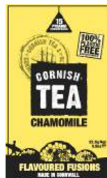
Organic Chamomile Fusions 6 x 1.3oz 5060322531717