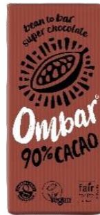
90% Cacao 10 x 70g 50-60102-66259-4