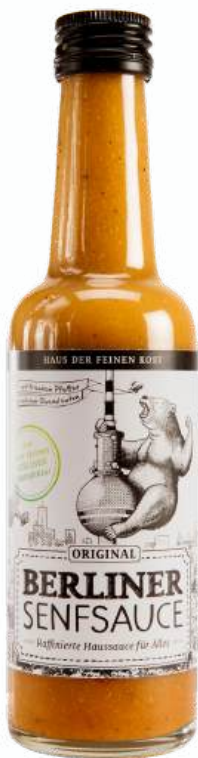
Berlin Mustard Sauce – 12 x 250ml – 4260267730096