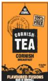
Organic Breakfast Fusions 6 x 1.3oz 5060322531519