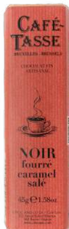
Dark Filled With Smooth Salted Caramel 30 x 45gr 54-00219-51570-1