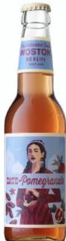
Date Pomegranate Craft Soda – 12 x 330ml – 4260189212038