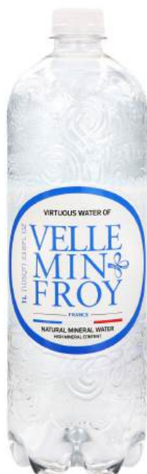
PET Natural Mineral Water 6 x 1000ml 37-60244-11170-8