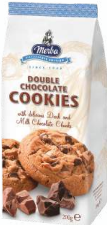
Merba, 12 x 7.05oz Double Chocolate Cookies 0-46214-17612-4