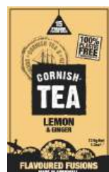
Organic Lemon And Ginger Fusions 6 x 1.3oz 5060322531755