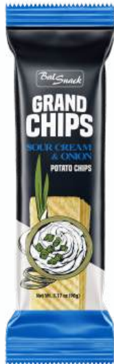
Sour Cream & Onion 16 x 3.17oz 47-40053-00895-5