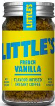
Flavoured Instant Coffee French Vanilla 6 x 50g 50-34718-08107-0