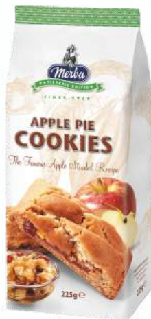
Merba, 12 x 7.9oz Apple Pie Cookies 87-10502-19661-4