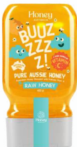
Buzz Raw Kids Squeeze (Vitamin C) 6 x 14.1oz 93-35217-01000-1