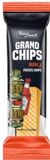
Smokey Bbq 16 x 3.17oz 47-40053-00896-2