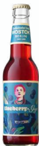
Blueberry Sage Craft Soda – 12 x 330ml – 4260189212656