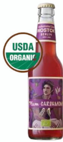
Organic Plum Cardamom Craft Soda – 12 x 330ml – 4260189213615

Berlin Heritage & Creative Rebellion Born in Berlin-Kreuzberg and inspired by the bold artistry of Eastern Germany's Soviet-era roots, WOSTOK revives the adventurous spirit of the original “Baikal” herbal soda — a symbol of freedom and individuality.