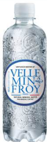
PET Natural Mineral Water 6 x 500ml 37-60244-11271-2