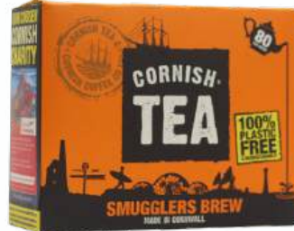
Cornish Tea Smugglers Brew 80S 12 x 8.8oz 5060322530000