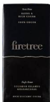
Solomon Islands, Guadalcanal 100% 12 x 70g 50-60685-66040-6