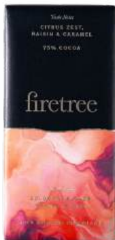
Solomon Islands, Makira Island 75% 12 x 70g 50-60685-66043-7