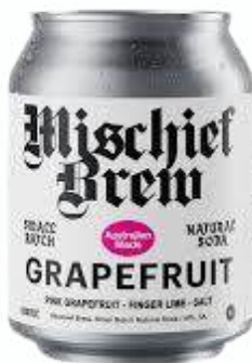
Grapefruit (4-Pack) 6 x (4 x 8.45 fl oz) 93-59084-00037-8