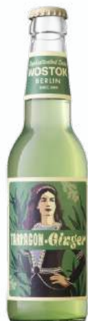
Tarragon Ginger Craft Soda – 12 x 330ml – 4260189213059