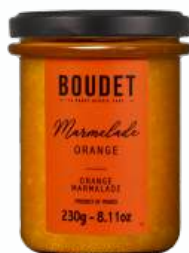
Orange Marmalade 6 x 8.11oz 812655000102