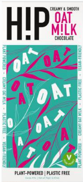
Creamy & Smooth Oat Milk 12 x 70g 50-60561-60314-5