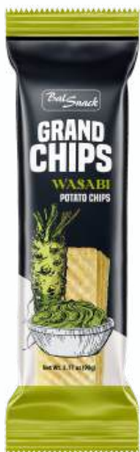
Spicy Wasabi 16 x 3.17oz 47-40053-00897-9