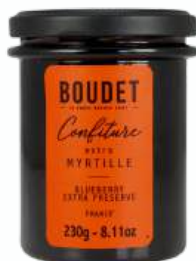
Blueberry 6 x 8.11oz 812655000034