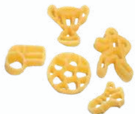
Soccer Noodles 12 x 500g 4008643163485