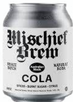
Cola (4-Pack) 6 x (4 x 8.45 fl oz) 93-59084-00016-3