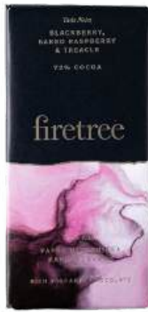
Papua New Guinea, Karkar Island 72% 12 x 70g 50-60685-66046-8