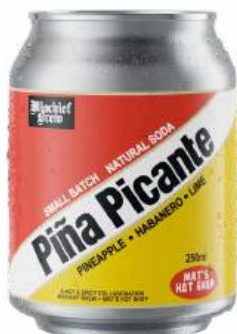
Piña Picante (4-Pack) 6 x (4 x 8.45 fl oz) 93-59084-00050-7