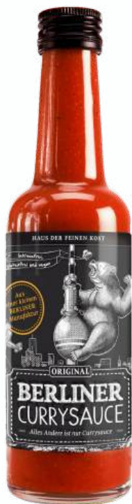
Berlin Curry Sauce – 12 x 250ml – 4260267730300