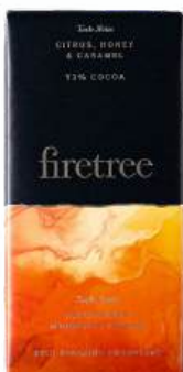
Philippines, Mindanao Island 73% 12 x 70g 50-60685-66044-4