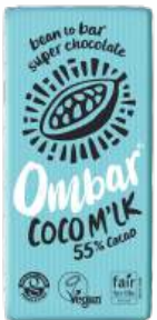
Coco Mylk 10 x 70g 50-60102-66210-5