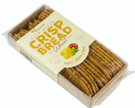
Wheat Flat Bread with Cheese, Tomato & Basil 10 x 130g 4771218201935