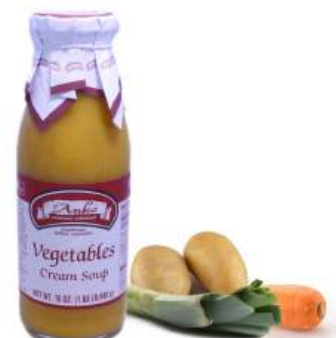
Vegetables Soup 12 x 500ml 8-12667-00005-3