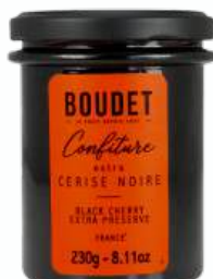
Black Cherry 6 x 8.11oz 812655000010