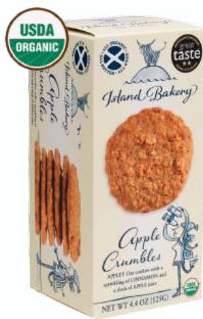
Organic Apple Crumble 12 x 4.4oz 5060027070160