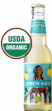
Organic Lemon Mint Craft Soda – 12 x 330ml – 4260189213752