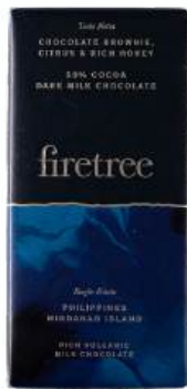
Philippines Mindanao Island 50% 12 x 70g 50-60685-66051-2