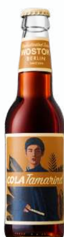
Cola Tamarind Craft Soda – 12 x 330ml – 4260189213691