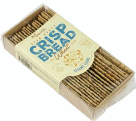
Wheat Flat Bread with Sesame Seeds 10 x 130g 4771218201447