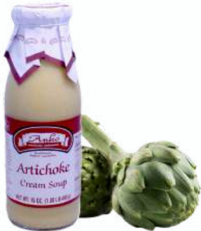
Artichoke Cream Soup 12 x 500ml 8-12667-00013-8