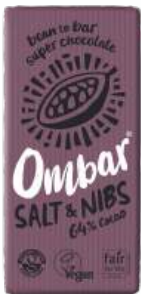
Salt & Nibs 10 x 70g 50-60102-66224-2