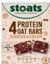
Protein Oat Bar- Cookies & Cream 10 x 168g 50-60183-67446-2