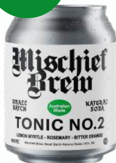
Tonic No.2 (4-Pack) 6 x (4 x 8.45 fl oz) 93-59084-00022-4