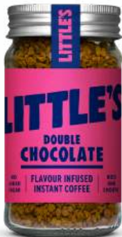
Flavoured Instant Coffee Double Chocolate 6 x 50g 50-34718-08103-2