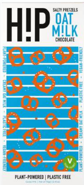
Salty Pretzels Oat Milk Chocolate 12 x 70g 50-60561-60313-8