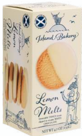
Lemon Melts 12 x 4.7oz 5060027070207