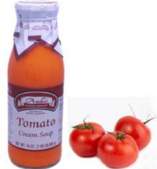
Tomato Cream Soup 12 x 500ml 8-12667-00014-5