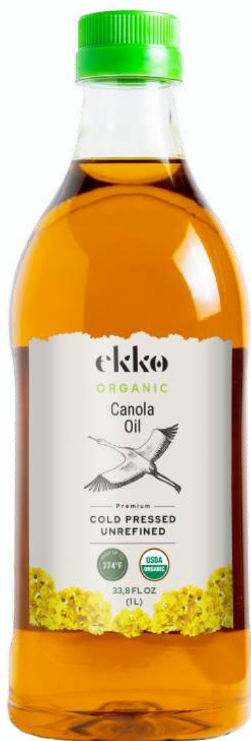
Ekko, 12 x 33.8fl oz Organic Cold Pressed Unrefined Canola Oil PET 1L 47-79048-08079-9