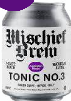
Tonic No.3 (4-Pack) 6 x (4 x 8.45 fl oz) 93-59084-00035-4