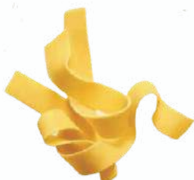
Wide Egg Noodles 8mm – 12 x 500g – 4008643163027