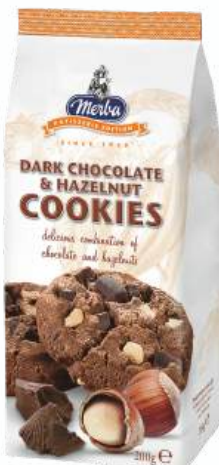
Merba, 12 x 7.05oz Dark Chocolate & Hazelnut Cookies 87-10502-00786-6