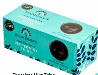
Chocolate Mint Thins 8 x 150g 50-60107-65004-6