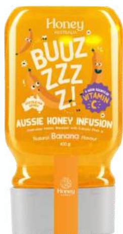
Buzz Banana Kids Squeeze (Vitamin C) 6 x 14.1oz 93-35217-00983-8