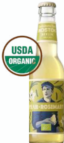
Organic Pear Rosemary Craft Soda – 12 x 330ml – 4260189213073