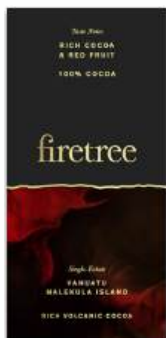
Vanuatu, Malekula Island, 100% 12 x 70g 50-60685-66050-5