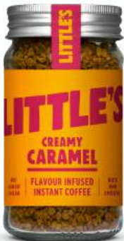
Flavoured Instant Coffee Creamy Caramel 6 x 50g 50-34718-08101-8