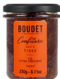
Fig 6 x 8.11oz 812655000041