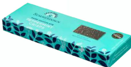
Chocolate Mint Crisps 8 x 170g 50-60107-65007-7