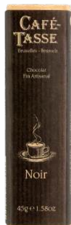
Dark 60% 30 x 45gr 54-00219-50550-4