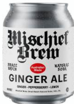
Ginger Ale (4-Pack) 6 x (4 x 8.45 fl oz) 93-59084-00018-7