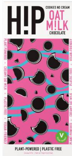
Cookies No Cream Oat Milk Chocolate 12 x 70g 50-60561-60315-2