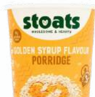
Golden Syrup Flavour Porridge Bowl 16 x 60g 50-60183-67266-6