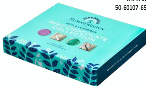
Mint Chocolate Collection 8 x 170g 50-60107-65026-8