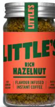
Flavoured Instant Coffee Rich Hazelnut 6 x 50g 50-34718-08102-5