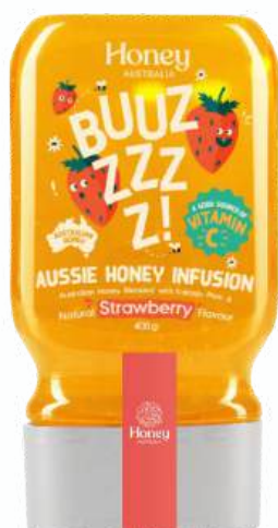
Buzz Strawberry Kids Squeeze (Vitamin C) 6 x 14.1oz 93-35217-00982-1