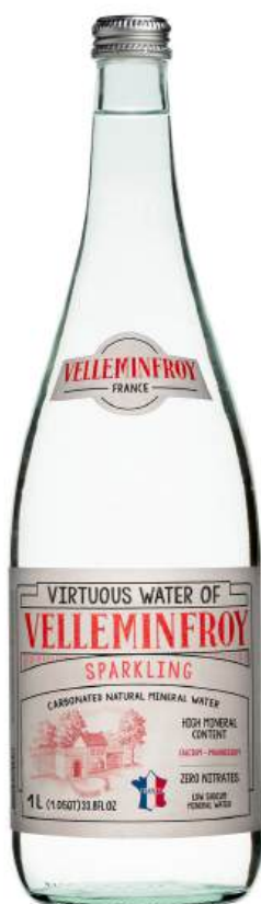
Vintage Carbonated Natural Mineral Water 6 x 1000ml 37-60244-11008-4