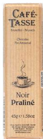
Dark Praliné 60% 30 x 45gr 54-00219-50530-6