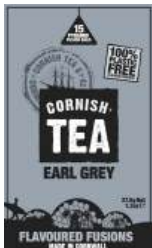
Organic Earl Grey Fusions 6 x 1.3oz 5060322531526