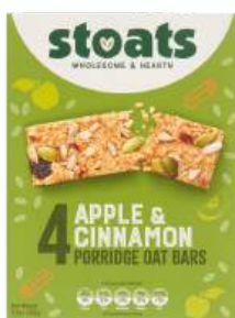
Apple & Cinnamon Porridge Oat Bar 10 x 168g 50-60183-67389-2