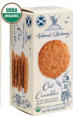
Organic Oat Crumbles 12 x 4.4oz 5060027070238