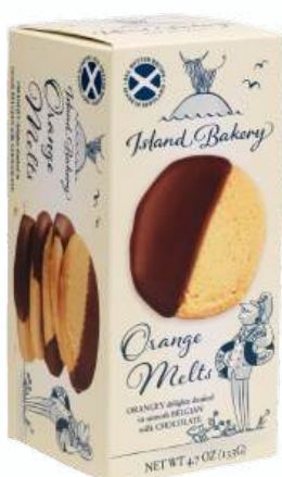
Orange Melts 12 x 4.7oz 5060027070269