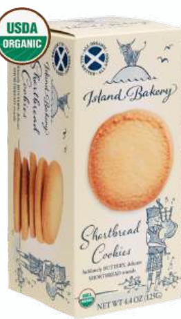
Organic Shortbread 12 x 4.4oz 5060027070221