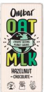
Oat M'Lk Hazelnut 10 x 70g 50-60102-66235-8