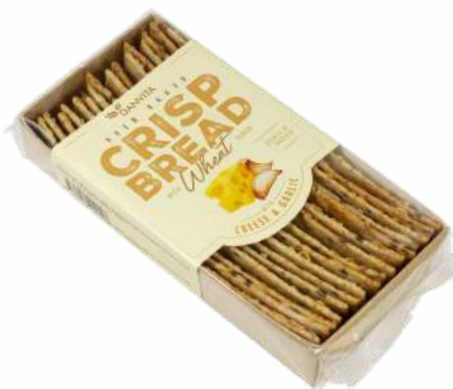
Wheat Flat Bread with Cheese & Garlic 10 x 130g 4771218200198