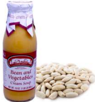
Bean And Vegetables Cream Soup 12 x 500ml 8-12667-00015-2