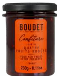
Four Red Fruits 6 x 8.11oz 812655000058