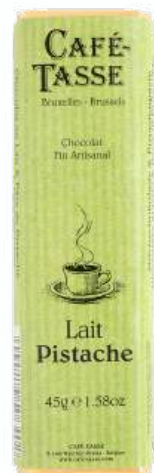
Milk Pistachio 38% 30 x 45gr 54-00219-50640-2