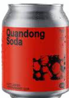
Quandong Soda (4-Pack) 6 x (4 x 8.45 fl oz) 93-6990001446-5