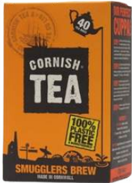
Cornish Tea Smugglers Brew 40S 12 x 4.4oz 5060322530031