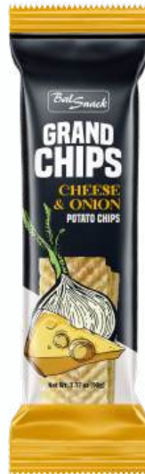
Cheese & Onion 16 x 3.17oz 47-40053-00894-8