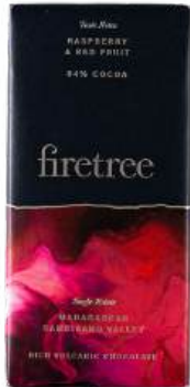
Madagascar, Sambirano Valley 84% 12 x 70g 50-60685-66041-3