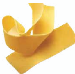
Extra Wide Egg Noodles 20mm 12 x 500g 4008643163393