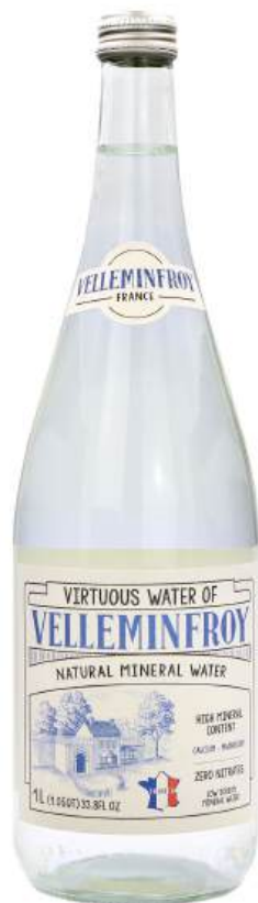
Vintage Natural Mineral Water 6 x 1000ml 37-60244-11004-6