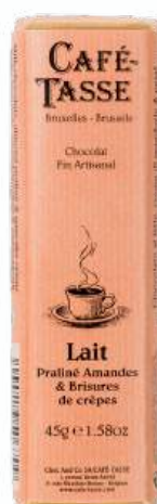
Milk Almond Praliné & Crispy Crêpe 30 x 45gr 54-00219-50670-9