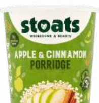
Apple & Cinnamon Porridge Bowl 16 x 60g 50-60183-67015-0