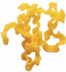
Wave Noodles 12 x 500g 4008643163256