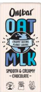
Oat M'Lk Smooth & Creamy 10 x 70g 50-60102-66233-4