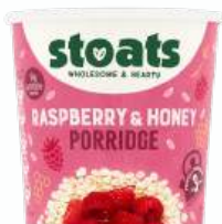
Raspberry & Honey Porridge Bowl 16 x 60g 50-60183-67224-6