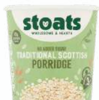
No Added Sugar Traditional Scottish Porridge Bowl 16 x 60g 50-60183-67024-2