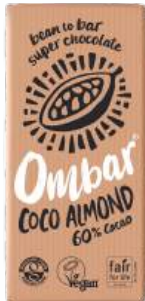
Coco Almond 10 x 70g 50-60102-66212-9