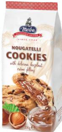
Merba, 12 x 7.05oz Nougatelli Cookies 0-46214-40101-1