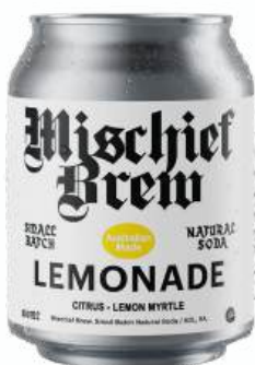
Lemonade (4-Pack) 6 x (4 x 8.45 fl oz) 93-59084-00014-9