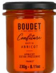
Apricot 6 x 8.11oz 812655000003