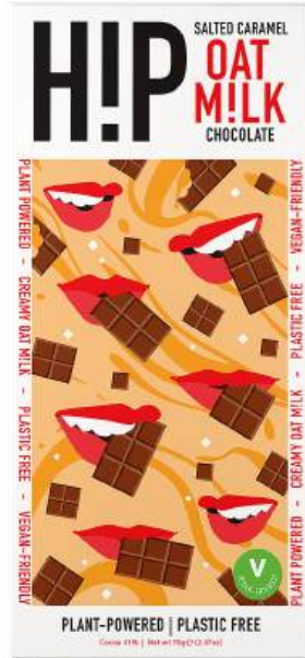
Salted Caramel Milk Chocolate 12 x 70g 50-60561-60316-9