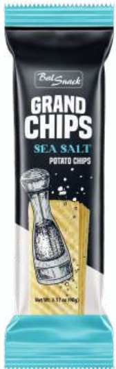
Simply Sea Salt 16 x 3.17oz 47-40053-00893-1