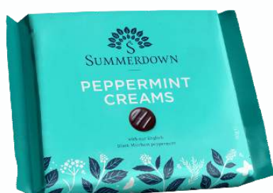
Chocolate Mint Creams 20 x 75g 50-60107-65008-4