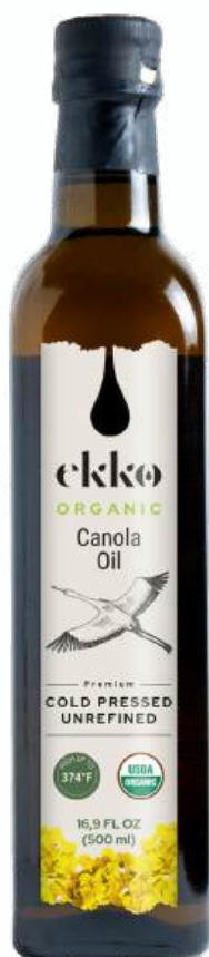
Ekko, 12 x 16.9fl oz Organic Cold Pressed Unrefined Canola Oil 500ML 47-79048-08070-6