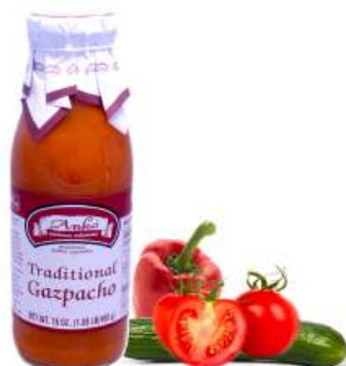
Traditional Gazpacho 12 x 500ml 8-12667-00001-5