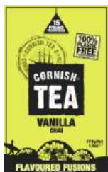
Organic Vanilla Chai Fusions 6 x 1.3oz 5060322531564