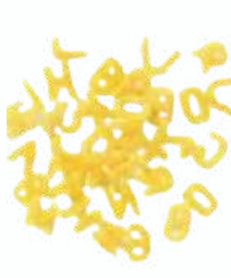
Soup Letters 12 x 500g 4008643163485