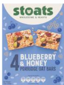
Blueberry & Honey Porridge Oat Bar 10 x 168g 50-60183-67391-5