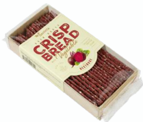
Vegetable Crackers Beetroot 10 x 130g 4771218201751