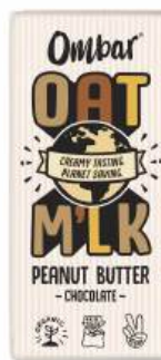
Oat M'Lk Peanut Butter 10 x 70g 50-60102-66277-8