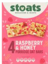
Raspberry & Honey Porridge Oat Bar 10 x 168g 50-60183-67401-1