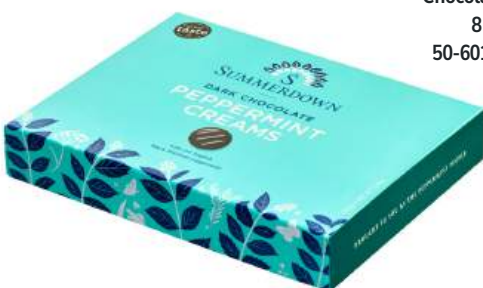
Chocolate Mint Creams 8 x 200g 50-60107-65000-8