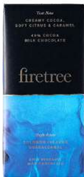
Solomon Islands Guadalcanal 40% 12 x 70g 50-60685-66052-9