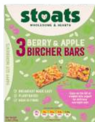
Bircher Bar- Berry & Apple 10 x 135g 50-60183-67436-3