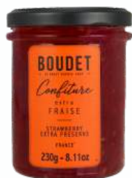
Strawberry 6 x 8.11oz 812655000089