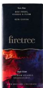
Solomon Islands, Guadalcanal 82% 12 x 70g 50-60685-66042-0