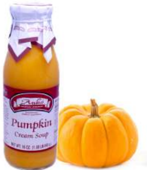
Pumpkin Cream Soup 12 x 500ml 8-12667-00017-6