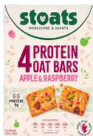
Protein Oat Bar- Apple & Raspberry 10 x 168g 50-60183-67448-6