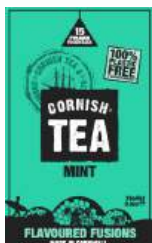
Organic Mint Fusions 6 x 1.3oz 5060322531557