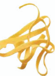
Egg Noodles 4mm – 12 x 500g – 4008643163034

100 g dried pasta results up to 300 g ready-cooked pasta.