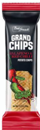
Jalapeno And Red Chili 16 x 3.17oz 47-40053-00892-4