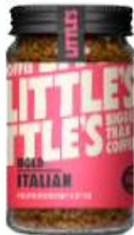
Premium Origin Instant Coffee Italian Rich Roast 6 x 50g 50-34718-07002-9