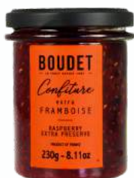
Raspberry 6 x 8.11oz 812655000096