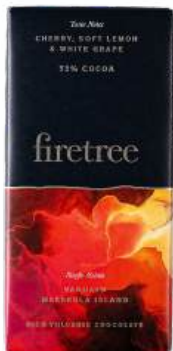
Vanuatu, Malekula Island, 72% 12 x 70g 50-60685-66045-1