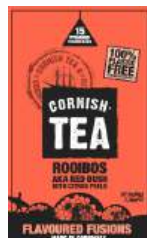
Organic Rooibos Fusions 6 x 1.3oz 5060322531731