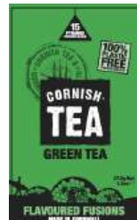
Organic Green Tea Fusions 6 x 1.3oz 5060322531533