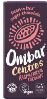
Centres Raspberry & Coconut 10 x 70g 50-60102-66219-8