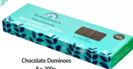
Chocolate Dominoes 8 x 200g 50-60107-65016-9